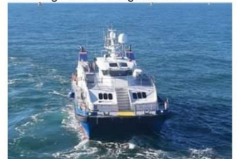
Fob Swath working on Seamander Windfarm- Oostende, Belgium