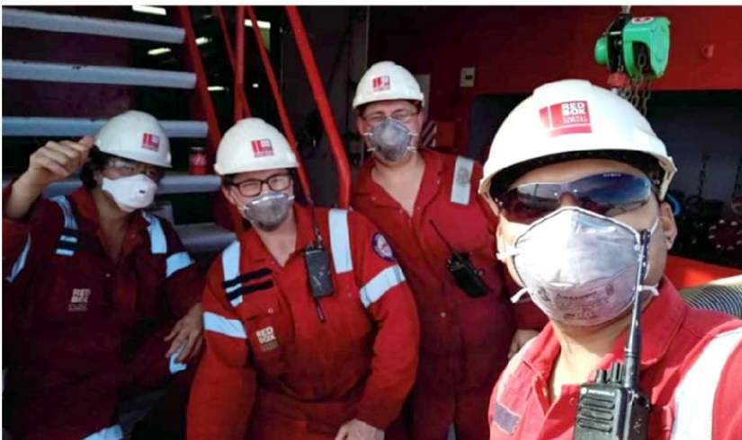
Standby for mooring Operation in Pattaya, Thailand