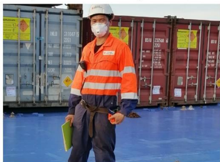
Loading of containers in India

I am yet to catch all of my dreams, but at least for now, I have started the chase.