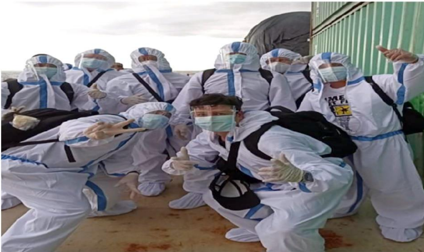
Happy Faces behind the masks of offsigners - MV Audax crew change in Manila