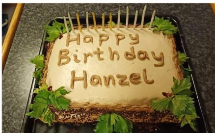
D/C H. Chua - 20.11.20 Birthday