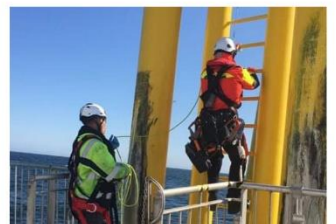
A/B Jigger B. Reodique assisting Technician up on the windmill tower - FOB Swath